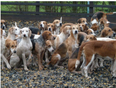
The hunt gathers for the January Meeting at Stonecroft.